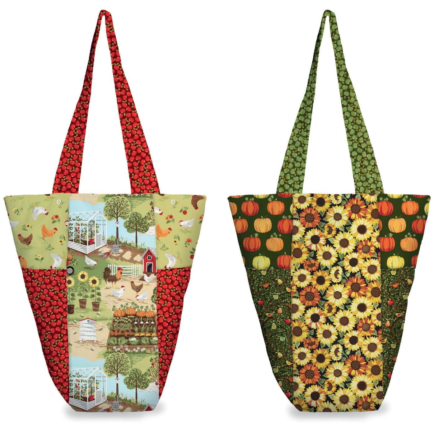
Bag A Scenic

A quick and easy to make shaped tote bag. Designed by Janet Goddard www.patchworkpatterns.co.uk Finished Size 16" x 14" x 5" (40cm x 35cm x 13cm) excluding handles using the Good Life collection from Makower UK www.makoweruk.com